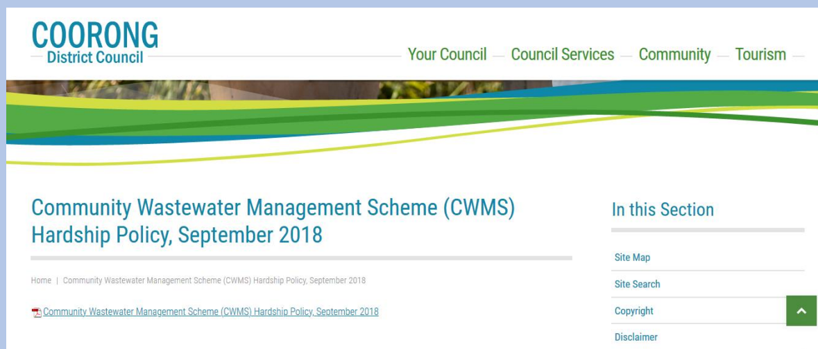
Figure 2. Coorong District Council CWMS Hardship Policy

Information about the Council's Hardship Policy is available on its website (Fig 2) and applications for financial hardship consideration can be made by accessing an application form from the council or downloading it from Council's website (Fig 3).