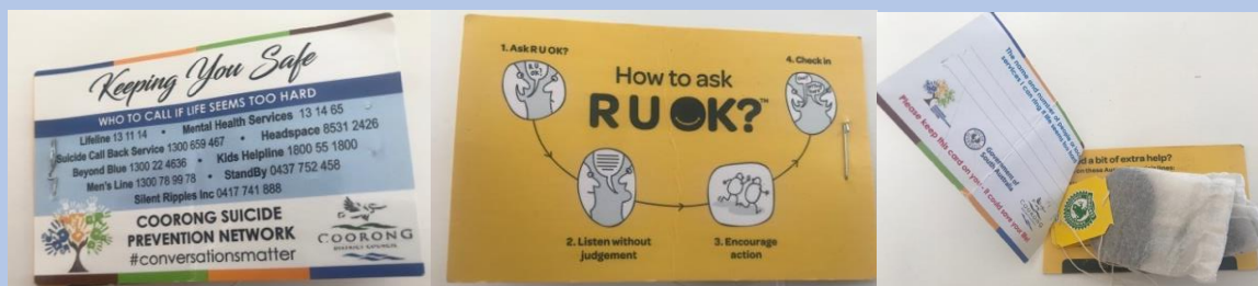
Figure 1: Teabag Wallet Cards

Council's customer service staff were the first contact point for community members, and so an investment in training was made to provide staff with skills in recognising signs of stress and hardship. One of the initiatives to come out of the Conversations Matter forums was the development of tea bag wallet cards #conversationsmatter (Figure 1). These cards encouraged people to invite others to share a cup of tea and conversation about an individual's wellbeing. These were made available to Council staff for distribution and use.