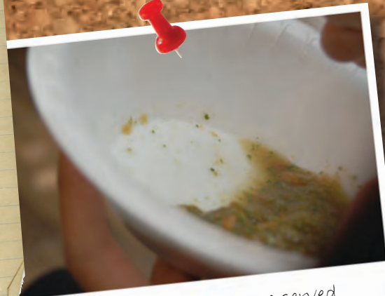
Hundreds of meals are served each day across SA to people in crisis