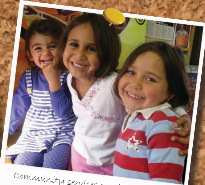
Community services provide families and carers with support