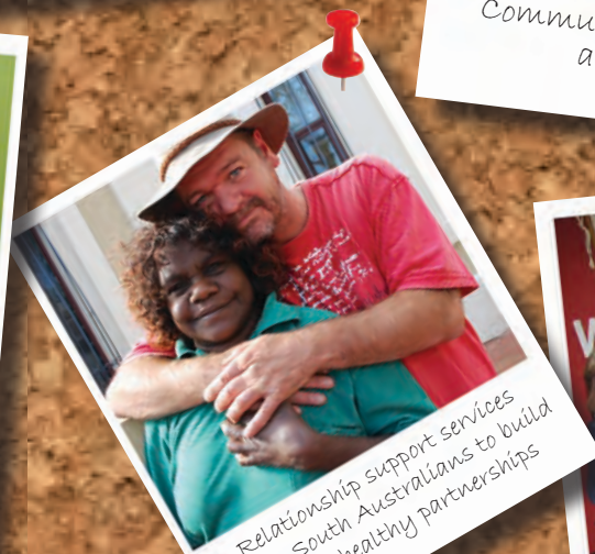
Relationship support services assist South Australians to build strong healthy partnerships