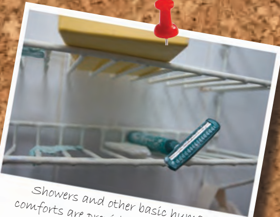
Showers and other basic human comforts are provided by community services across SA every day