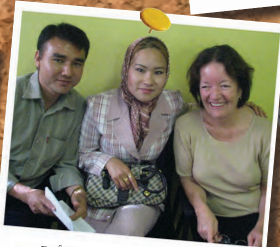
Refugee and other multicultural community programs assist new Australians in all aspects of their lives