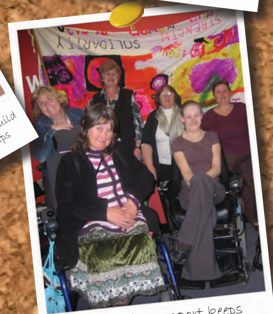
Community support keeps these women strong, and offers respite for their carers