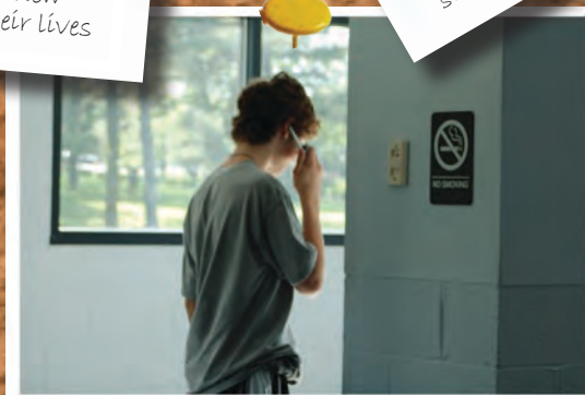
Counselling services help people cope and save lives, too