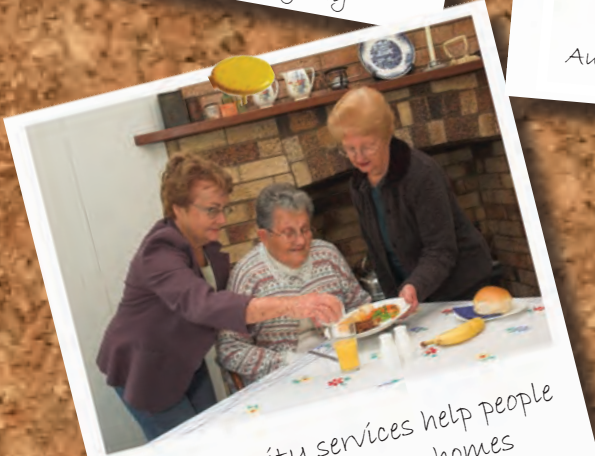
Community services help people stay in their own homes